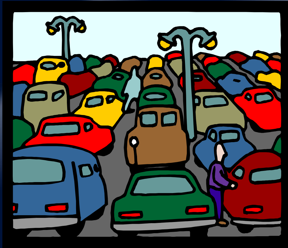
Parking lot patrol